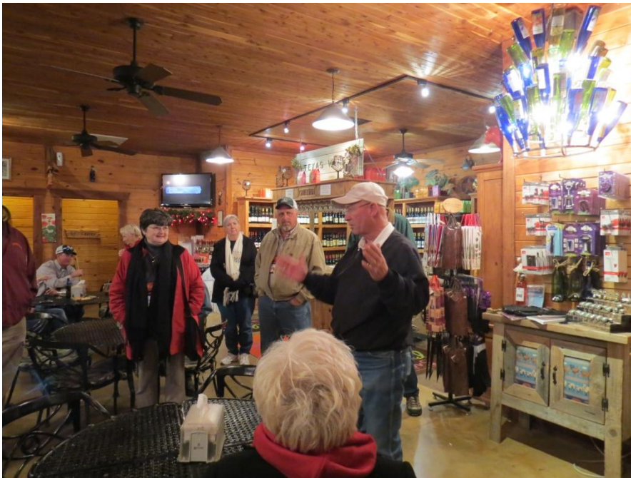
We topped off the evening with a steak dinner prepared by Texas Young Farmers at the dance hall in Luckenbach, Texas.