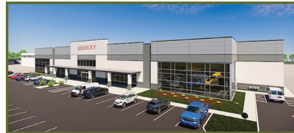
Messicks Farm Equipment's new location

We received an invitation to attend the Northern Lebanon Chapter's dinner meeting at Country Fare Restaurant this month. I'm not one to turn down good food... so that was another night of great food and fellowship. It is wonderful to see people getting together again and being able to share struggles, ideas, and just have a good time.