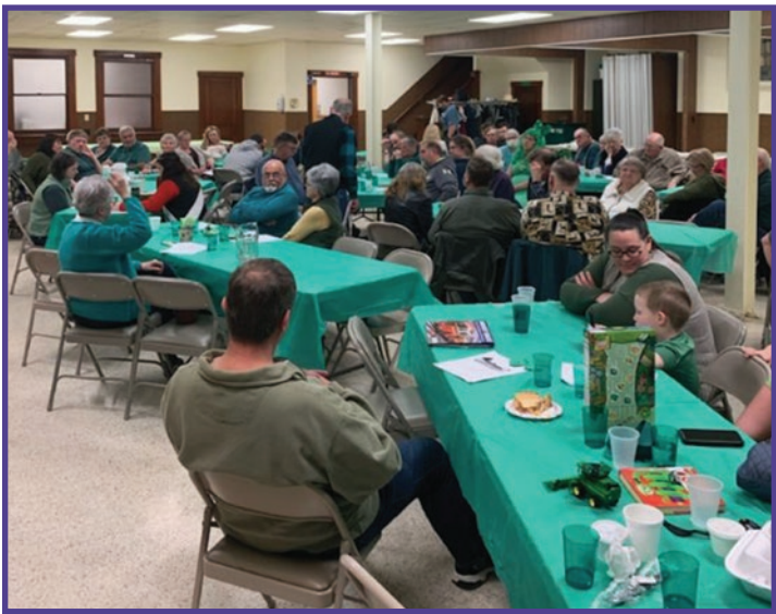
Twenty-nine members of the Berlin Brothersvalley Young Farmer Chapter attended the Berlin FFA Chapter’s annual banquet on St. Patrick’s Day in support of the local chapter.

Though the group will no longer hold a county picnic in the fall during harvest season, they will be planning other events to get together for fellowship.