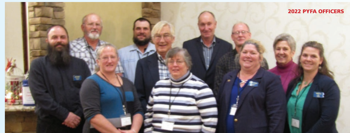
2022 PYFA OFFICERS

Next year's conference will be in February in the Gettysburg area. Watch for more information.