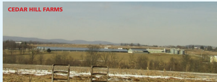
CEDAR HILL FARMS

The next stop was Wags Brothers Meats , owned by Byron Wagner. Kelly Young led the tour through the entire process, from loading off the truck to the processing room where butchers were dividing the meat and processing hamburger, sausage, jerky and other products. The Wagners have their own steers and pigs, and in addition do custom butchering of all types of meat animals including 300 deer this hunting season. Wags Brothers recently opened a retail store in nearby Dover for convenience of their customers. We enjoyed samples of their delicious sweet bologna.