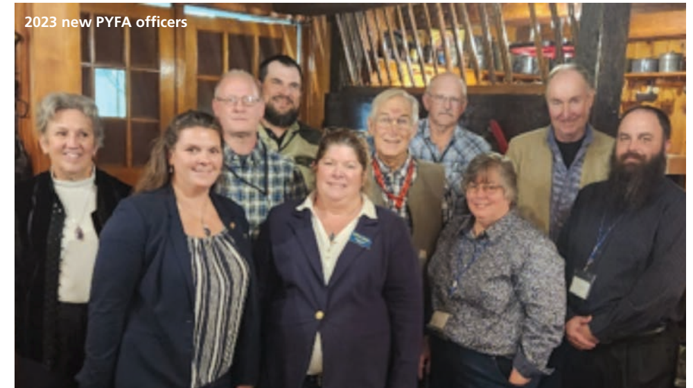
2023 new PYFA officers

resources for rural mental health. Agri-Safe works under a USDA grant through the Farm & Ranch Stress Assistance Network, to provide help for farmers who may be struggling with stress and suicidal thoughts.