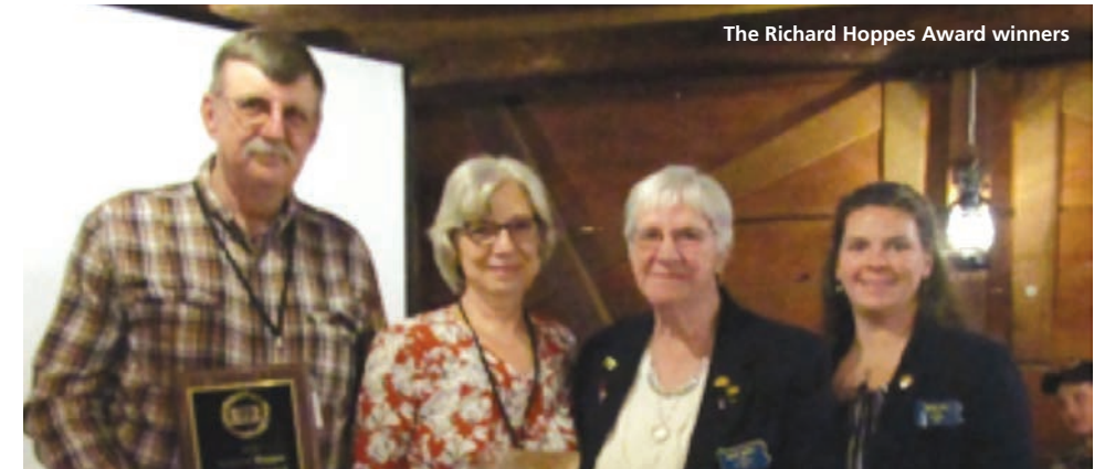
The Richard Hoppes Award winners

Military Park, spoke about the changing management of agricultural lands within the park which totals 6032 acres, plus the Eisenhower National Historic site of 690 acres, 90% of which is farmed. The Park Service tries to balance the historical significance of the 1860s with environmental concerns of today.